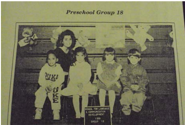
DEVON 1991—SLCD PRESCHOOL